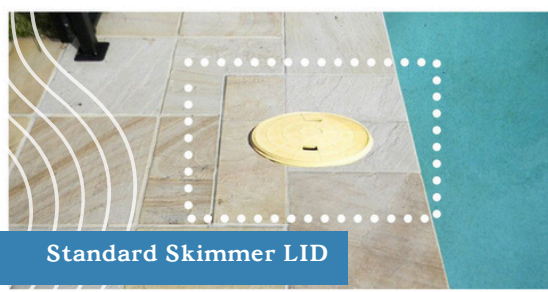
Standard Skimmer LID